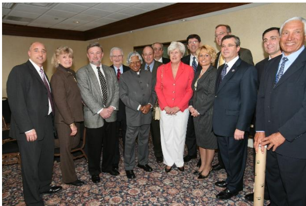
KY Leaders with His Excellency 3-24-2008